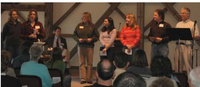
The first semester Religious Education teachers were recognized by the congregation during the service on March 13.