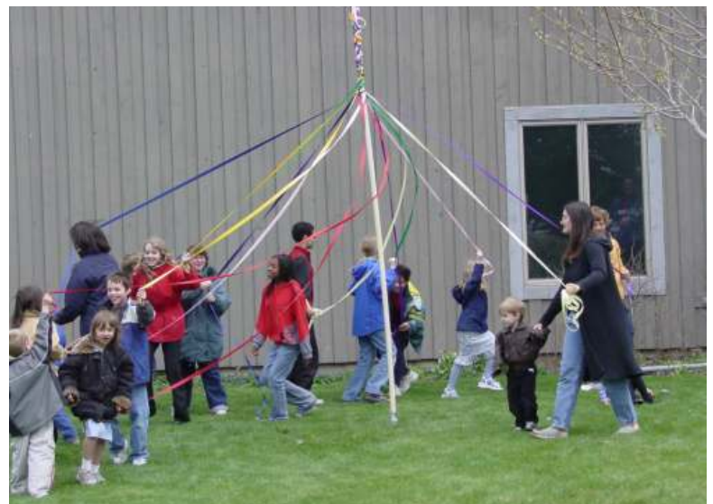
Parents and kids enjoyed wrapping the traditional Maypole after the service on Sunday, April 24.