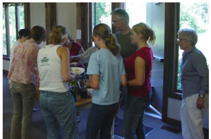
Part of the volunteer crew lines up for a delicious lunch at the All-Church Clean-up on August 27.