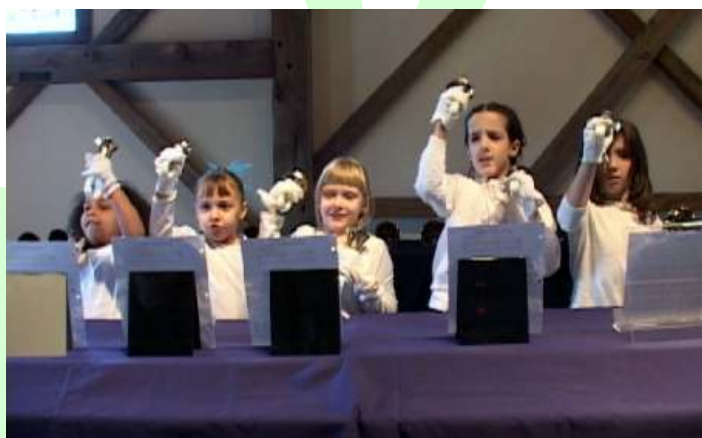
The Barn Bells II handbell choir wowed the crowd during their performance at the November 14 Music Sunday Service.